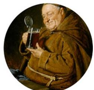
Images: Ancient Egyptians; First World War Troops; 1950s Beer Ad; Medieval Monk

Please note that this is a draft syllabus. The final version of the syllabus, including a list of all reading assignments, will be available on the OWL-Sakai course website prior to the beginning of classes in September.