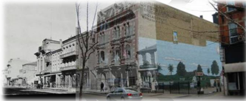
Image: Overlaid London Streetscape