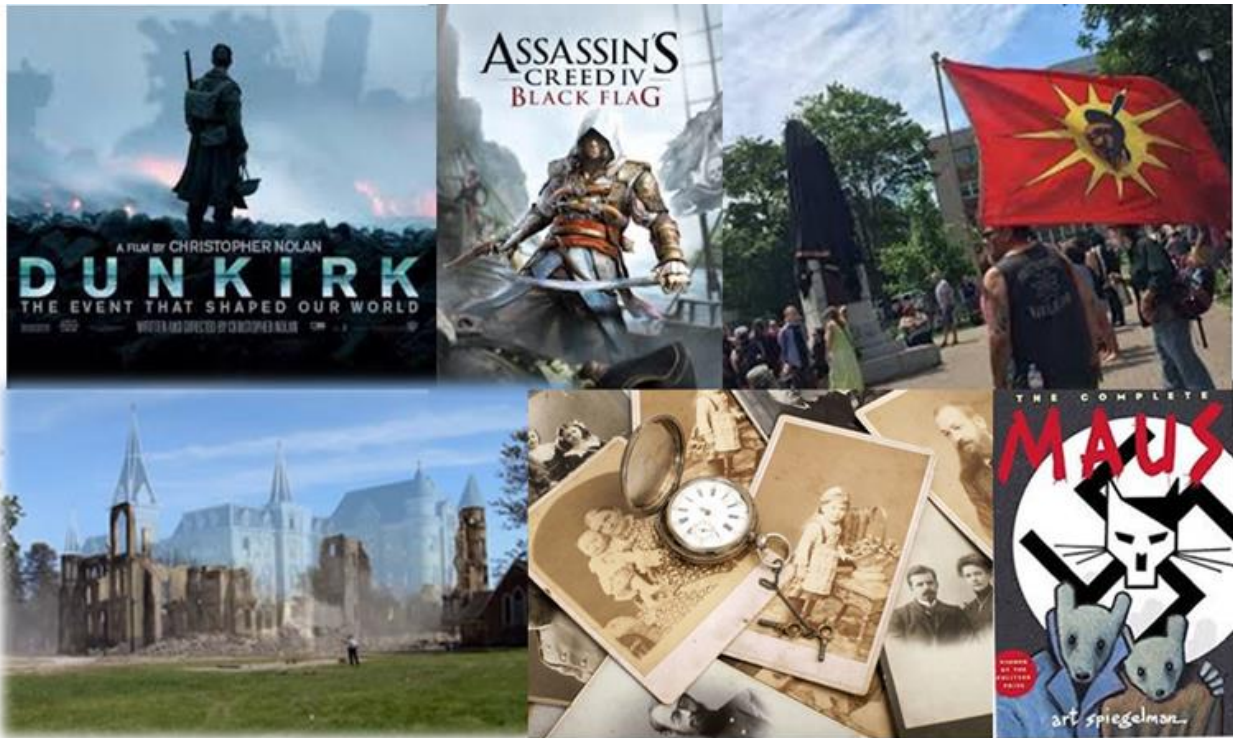
Images: Dunkirk film poster; Assassin's Creed video game; Indigenous protests; Alma College ruins; family history mementos; Maus graphic novel